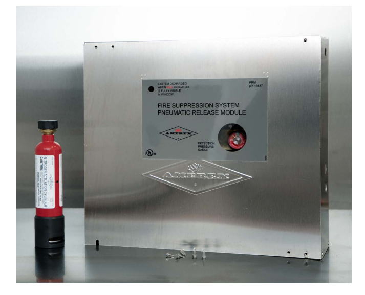
The Pneumatic Release Module uses heat and pressure-sensitive tubing for fire detection. This PRM tubing is extremely simple to install and suits heavy grease environments due to its small easily cleaned surface.

The PRM control mechanism interfaces with manual pull station(s), actuation networks, mechanical gas valves, and also offers electrical contacts for shutdown functions. The Amerex KP PRM can fire up to 10 agent cylinders and actuate up to two gas valves. The PRM comes complete with enclosure, accumulator, end of line fitting, and connector for up to two remote mechanical manual pull stations, two snap-action switches, and enclosure "knock-outs" for applicable connections.