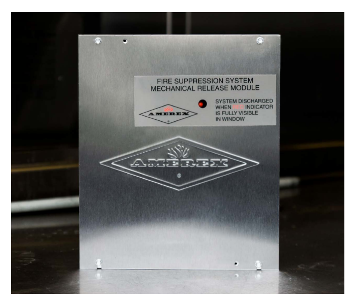
Amerex KP systems can easily be connected to fuel and ventilation shut downs as well as fire alarm or building control systems. The 48-pound tension spring on the detection line provides 200ft of quick response detection with 30 corner pulleys and 30 detectors, which is an advantage in larger system configurations.

The MRM comes preinstalled in its own stainless-steel enclosure. This enclosure displays a system status indicator and a window to observe the nitrogen cylinder pressure.