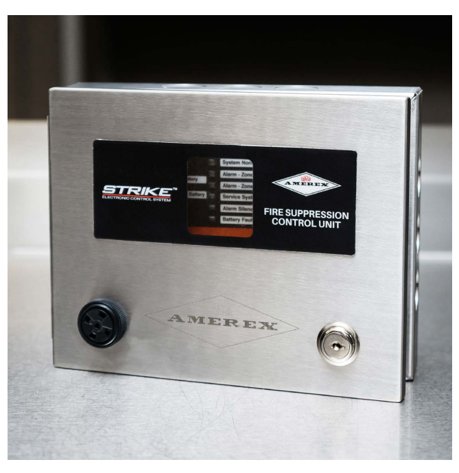
TWO SYSTEMS, ONE CONTROL UNIT