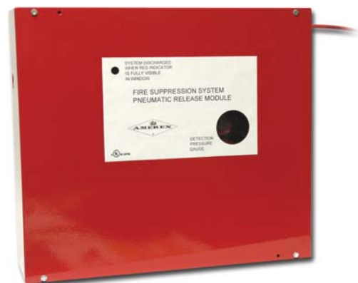
(SHOWN WITH COVER)