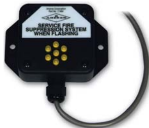
Part No. 17484